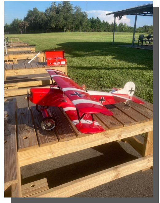
With the cowling on.