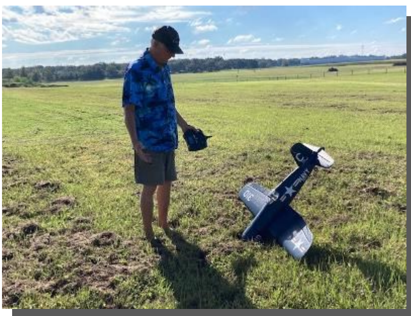
Then again, things don't always go as planned. E-Flite 1.2m F4U