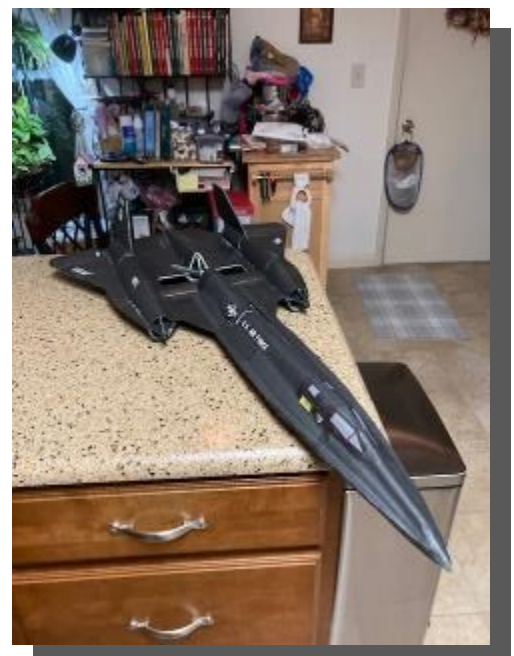
My hand made SR-71. Made out of foamboard.