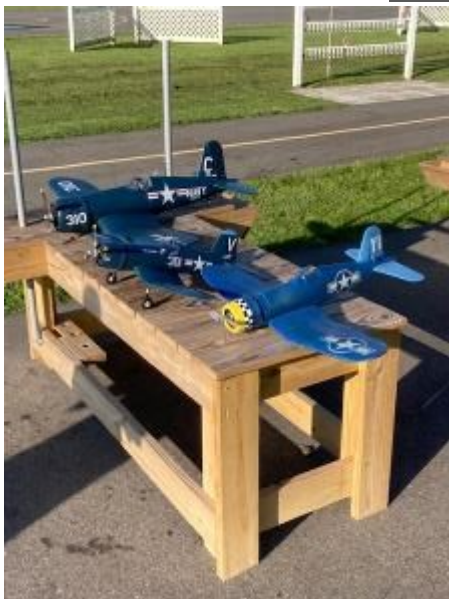
A few different copies of the F4U Corsair.

Tim's E-Flite My Flightline model from Motion RC. Wayne's GWS